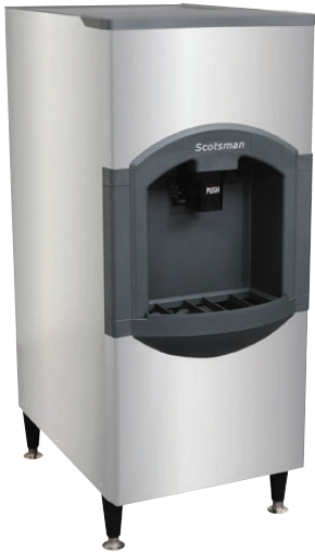
Easy Push Chute